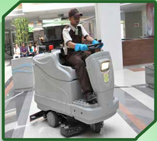
Ride On Scrubbing