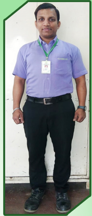
Multi Skill Technician