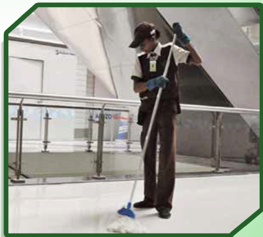
Manual Wet Mopping