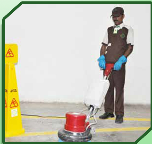
Single Disc Scrubbing