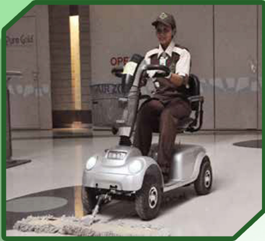
Dry Mop Scooty

We have done the shop cleaning & parking at Magnet Mall during the initial stages [Project cleaning]